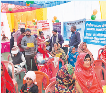
RUDSETI Stall, Jaipur ↓