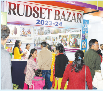
RUDSETI Bazaar, Nagaon ↓