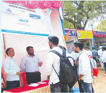
RUDSETI Stall, Bengaluru ↓